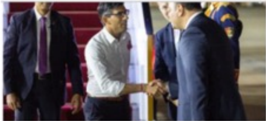
UK New Package of Climate Support Announced at COP27