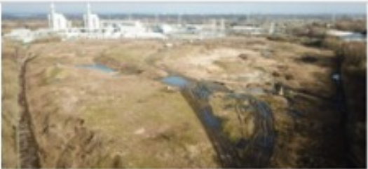
Planning Permission Secured for Manchester's First Hydrogen Fuel Hub