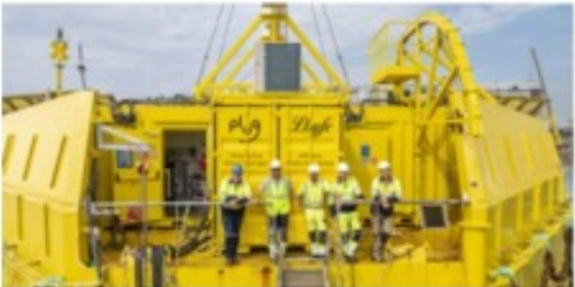
Lhyfe Launches the World's First Offshore Renewable Green