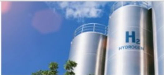
The Clean Hydrogen Accelerator Helping to Secure UK's Energy Supply