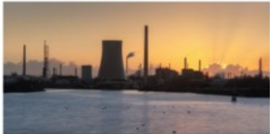
Cadent: Hydrogen Ten Point Plan