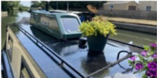
BOC: Powering Narrowboats with Hydrogen